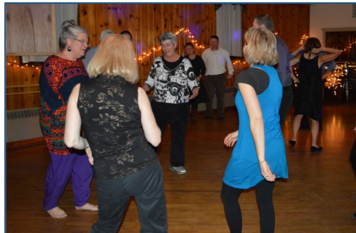
Guests dancing the night away at the Lewisburg Club

consider. We are looking for ways to bring us all together and we know that dancing may not be everybody's cup of tea. We are open to hear your suggestions. Please email me directly at peltier@bucknell.edu with those fabulous ideas.